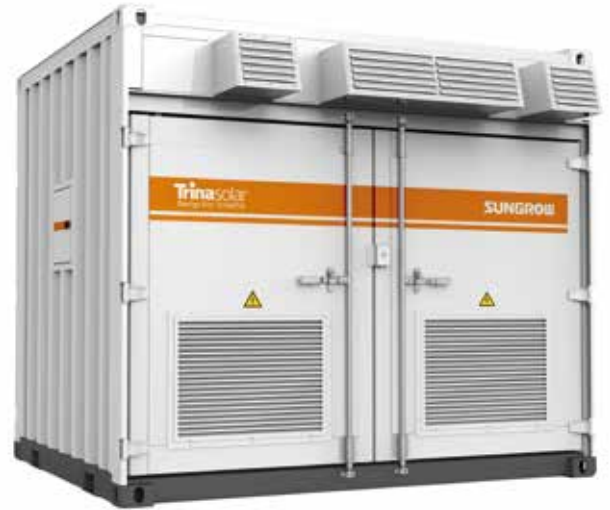
SUNGROW Inverter, Designed For TrinaPro